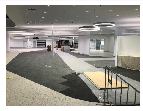
Flooring and lighting inside Main Library