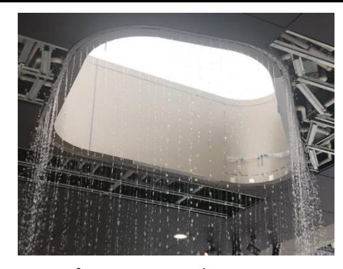
Water feature in Civic Plaza