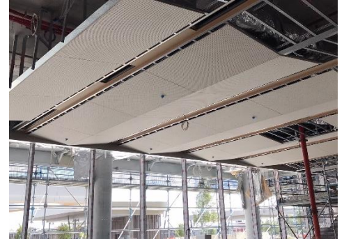
Framing of butterfly ceiling