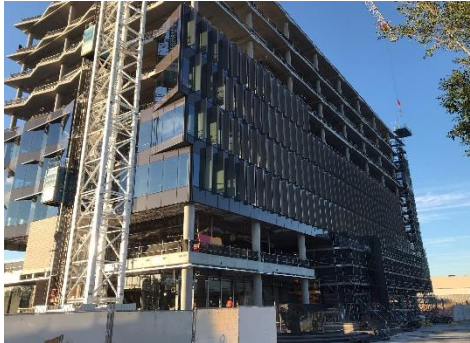
Administration building façade