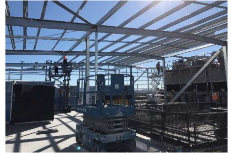
Administration building structural steel on roof