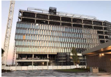
Administration building façade taking shape