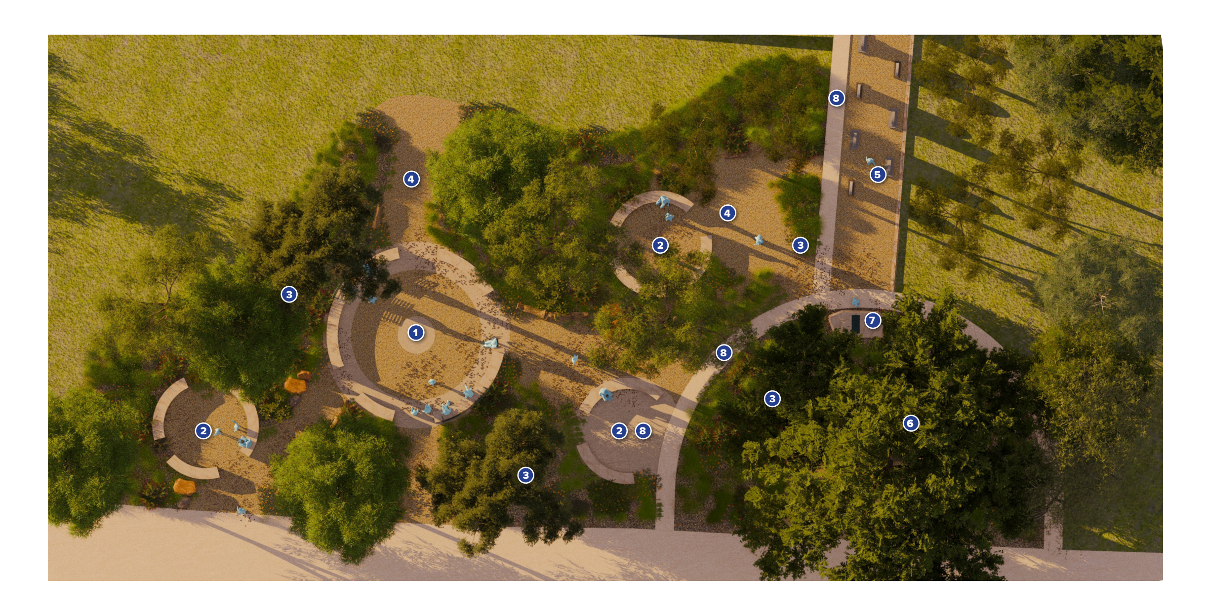
Figure 1.8 Concept Plan